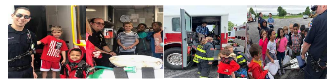
A detailed monthly Fire prevention report is available for review.

On Friday May 24<sup>th</sup> the Bradley Fire Department participated in the 'Careers on Wheels' event hosted by Bradley East school. Bradley FD personnel brought an engine and an ambulance to the event and discussed their careers "on wheels" with the students. 16 man hours were used for this event.